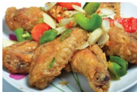
5. Chicken Wings - B. Salt & Pepper