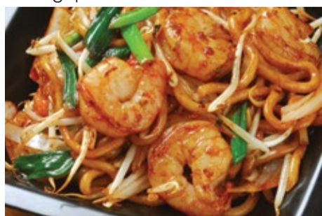
29. Japanese udon - C. King prawn