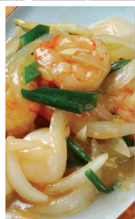
41. King prawn & scallops - A) Ginger & spring onion

All dishes exclude rice or chips Unless stated otherwise