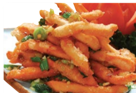
8. Smoked chicken