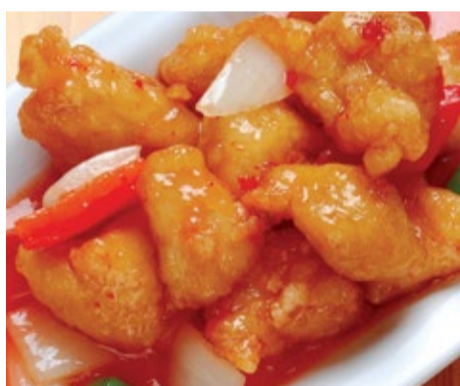
52. Sweet and sour Hong Kong style - B. Chicken