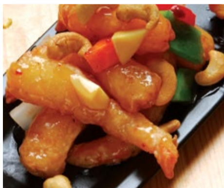
53. Kung po - A. King prawns