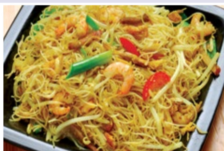
28. Singapore B. Vermicelli