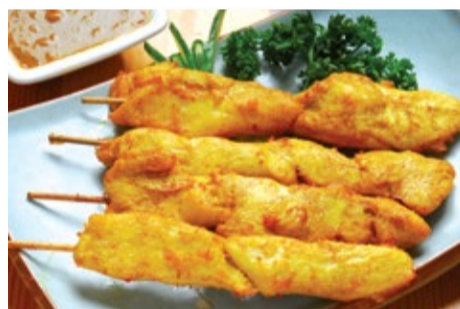
7. Chicken satay (5)