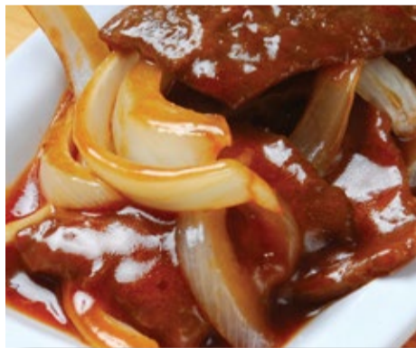
55. Fillet steak Chinese style