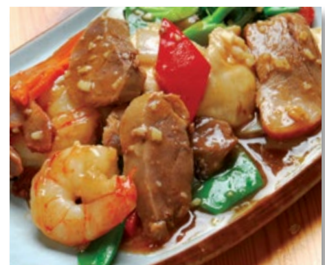
69. "Soo Chow duck"