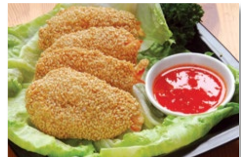
6. Sticky prawn