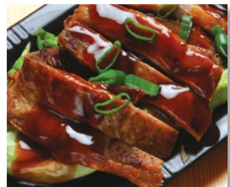
65. Crispy lamb in Cantonese sauce