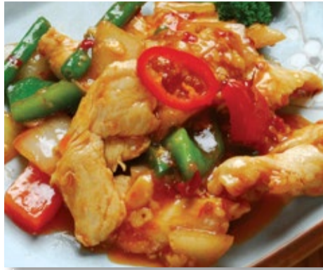
45. Chicken - F) Szechuan spicy sauce