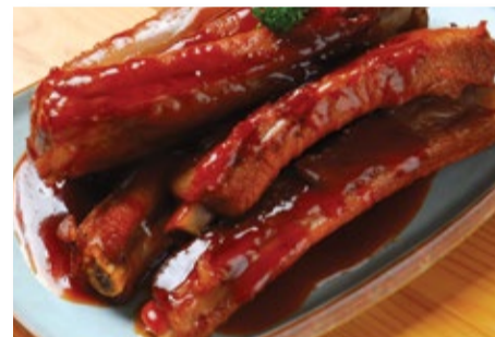
5. Spare ribs - A. Barbecue sauce