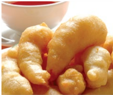
51. Sweet and sour - A. King prawn balls