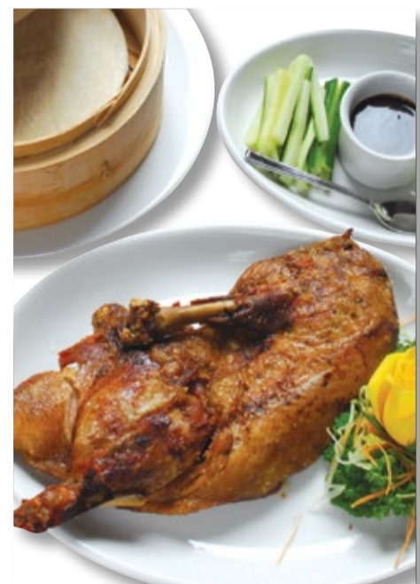
17. Crispy aromatic duck - 1/2