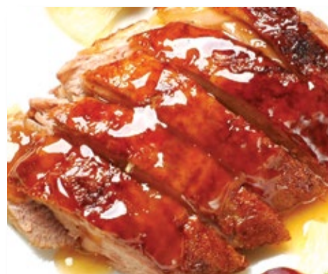
68. Roast duck in plum sauce

with Fried rice extra £1.70 Boiled rice extra £1.50 Chips extra £1.30