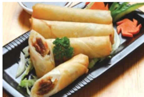
4. Aromatic duck rolls (5)