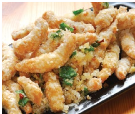
71. Vegetarian smoked chicken