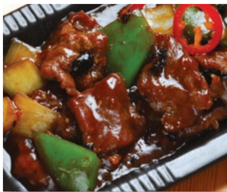
44. Beef - B) Black bean sauce