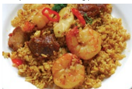
33. Nasi goreng special fried rice